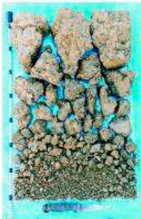
Poor (0) Soil dominated by extremely coarse, very firm clods with very few finer aggregates.