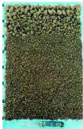
Good (2) Good distribution of friable finer aggregates with no significant clodding.