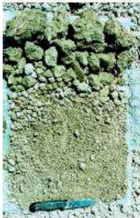
Medium (1) Soil contains significant proportions of both coarse firm clods and friable, fine aggregates.