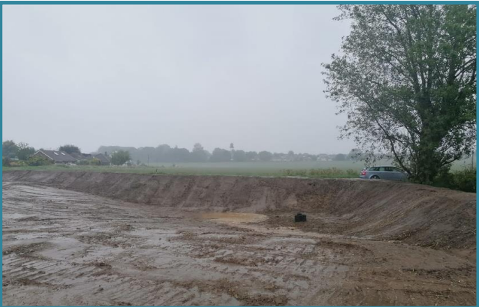
Figure 2. Bund during construction in June 2020

Upper Thurne Sub-Catchment Issues Sediment and nutrient-laden run-off was leaving fields and travelling along roads and drains, reducing the quality of water flowing into an internationally important tidal shallow lake - Martham Broad - part of the Upper Thurne Broads and Marshes Site of Special Scientific Interest (SSSI), Broads Special Area of Conservation (SAC) and Broadland Special Protection Area (SPA) and Ramsar site.