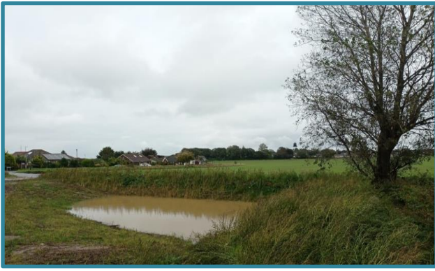
Figure 3. Bund after construction and following heavy rain in October 2020