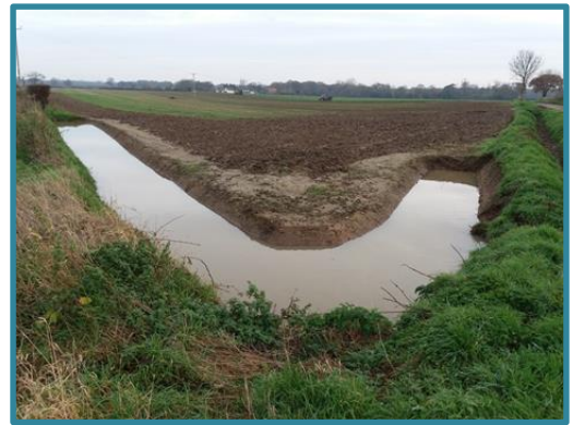
Figure 5. Field corner bund after rainfall, Fleggburgh