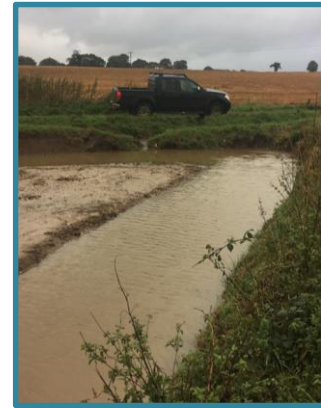
Figure 6. After heavy rain in October 2020