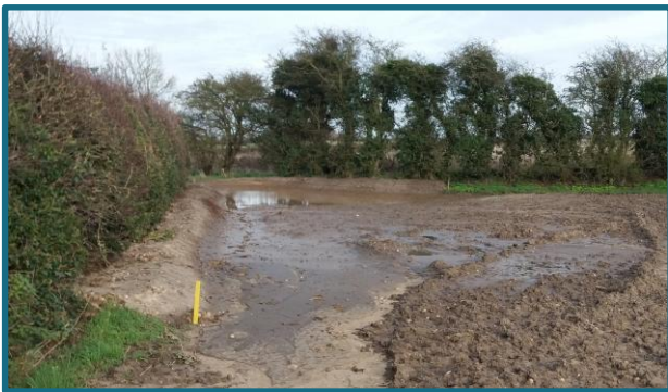
Figure 4. Field corner bund, West Somerton

A field corner bund was constructed in December 2019, and this was then enlarged in March 2020 in response to continued substantial run-off from the sloping corner of the field, even after deep cultivation has taken place (Figure 4). Further advice was given to the landowners and contractor to sub-soil in late summer, and to voluntarily take the corner of the field out of crop production, and consider alternative fields for root crop production.